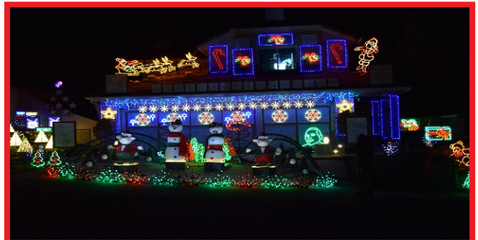
Belardo Lights in Tierrasanta