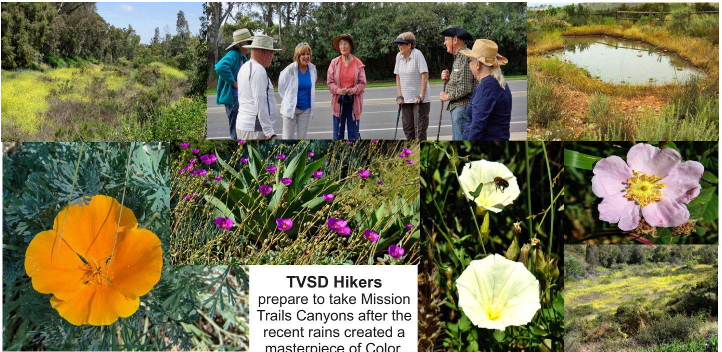
TVSD Hikers prepare to take Mission Trails Canyons after the recent rains created a masterpiece of Color.