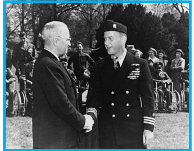
Medal of Honor awarded to Richard O'Kane by President Truman in 1946

Richard O'Kane (February 2, 1911 – February 16, 1994) was a United States Navy submarine commander in World War II, who was awarded the Medal of Honor for commanding USSTang in the Pacific War against Japan to the most successful record of any United States submarine ever. He also received three Navy Crosses and three Silver Stars, for a total of seven awards of the United States military's three highest decorations for valor in combat. Before commanding Tang , O'Kane served in the highly successful USSWahoo as executive officer and approach officer under noted Commander Dudley "Mush" Morton. In his ten combat patrols, five in Wahoo and five commanding Tang , O'Kane participated in more successful attacks on Japanese shipping than any other submarine officer during the war.