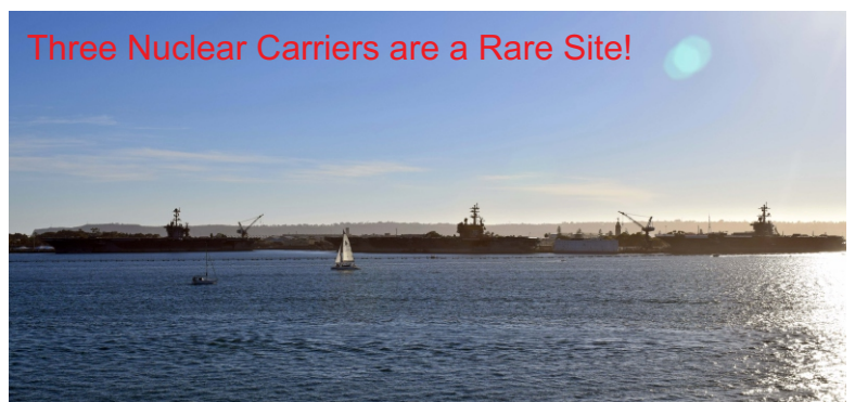
Three Nuclear Carriers are a Rare Site!