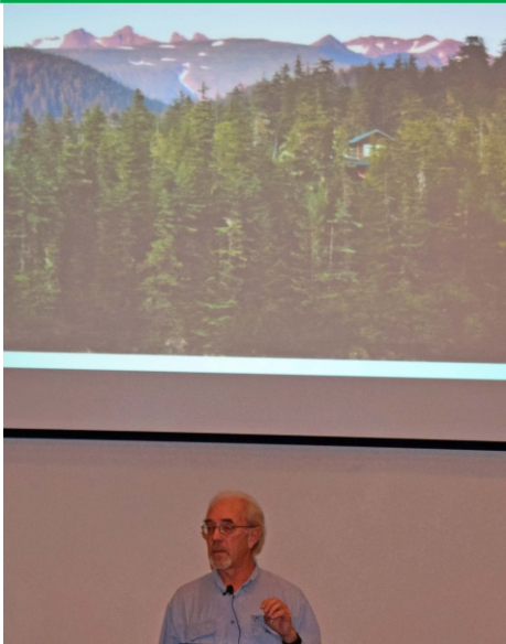
Great Power Point Show