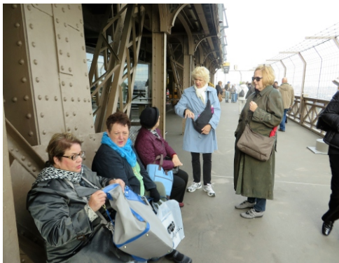
Blast from the Past 2013 Villagers enjoyed Paris and the Eiffel Tower