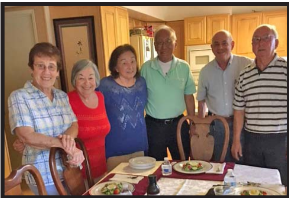
Recent Neighborhood Group Meetings