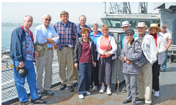
It was a typical Beautiful day on San Diego Bay We enjoyed lunch at the Fantail Cafe

If you have an offer please do not hesitate it to add it to your profile. If it is only a one time offer, your fellow time bankers will be grateful to know.