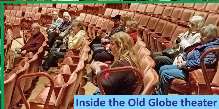
Inside the Old Globe theater

To see all photos: https://1drv.ms/a/s!Asmq8FF8Qe0Qgr5rtN8VlctBcQAcQ