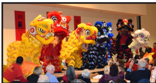
Chinese New Year Event on February 23

Spring is near! Time to think of new beginnings. One of the core values of time banking is to strengthen community by sharing time and talents with each other. There are more than ten categories of OFFERS on the website. If you haven't listed an offer or a request please review the categories and see how you can help or be helped. There is such a variety; from help with gardening to companionship to go to sporting events and restaurants. There is help with computers and smart phones and offers of items to borrow for special occasion.