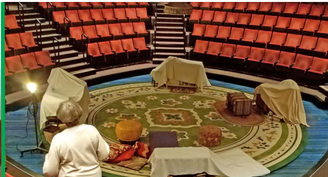
In the White theater