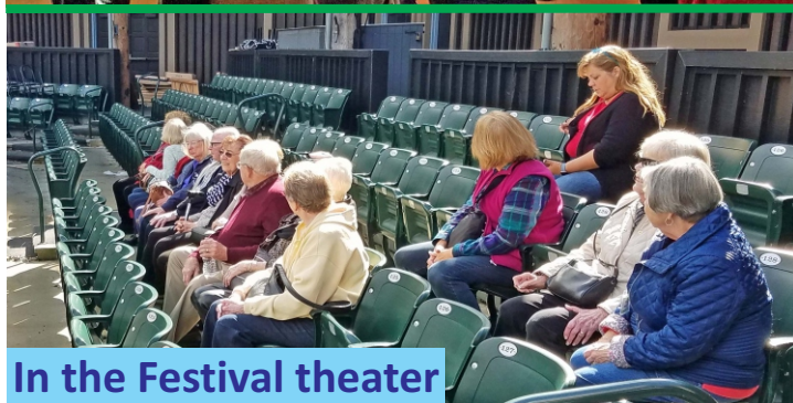
In the Festival theater