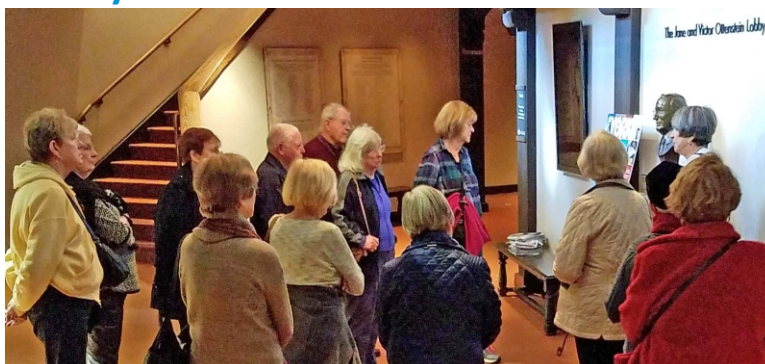
Old Globe Theatre Tour