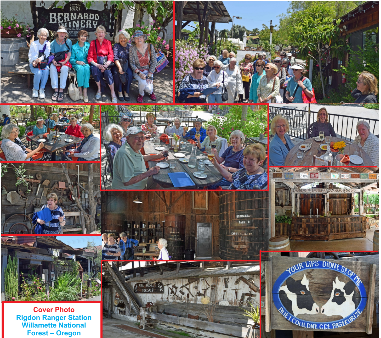
Cover Photo Rigdon Ranger Station Willamette National Forest – Oregon

See all Winery Pictures at: https://rigdon.smugmug.com/TVSD-Material/TVSD-Social-June-5-2019/