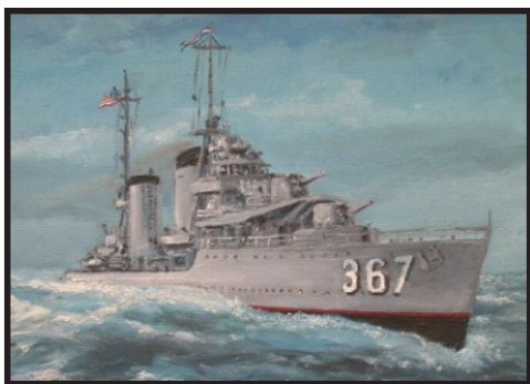
USS Lamson, DD 367