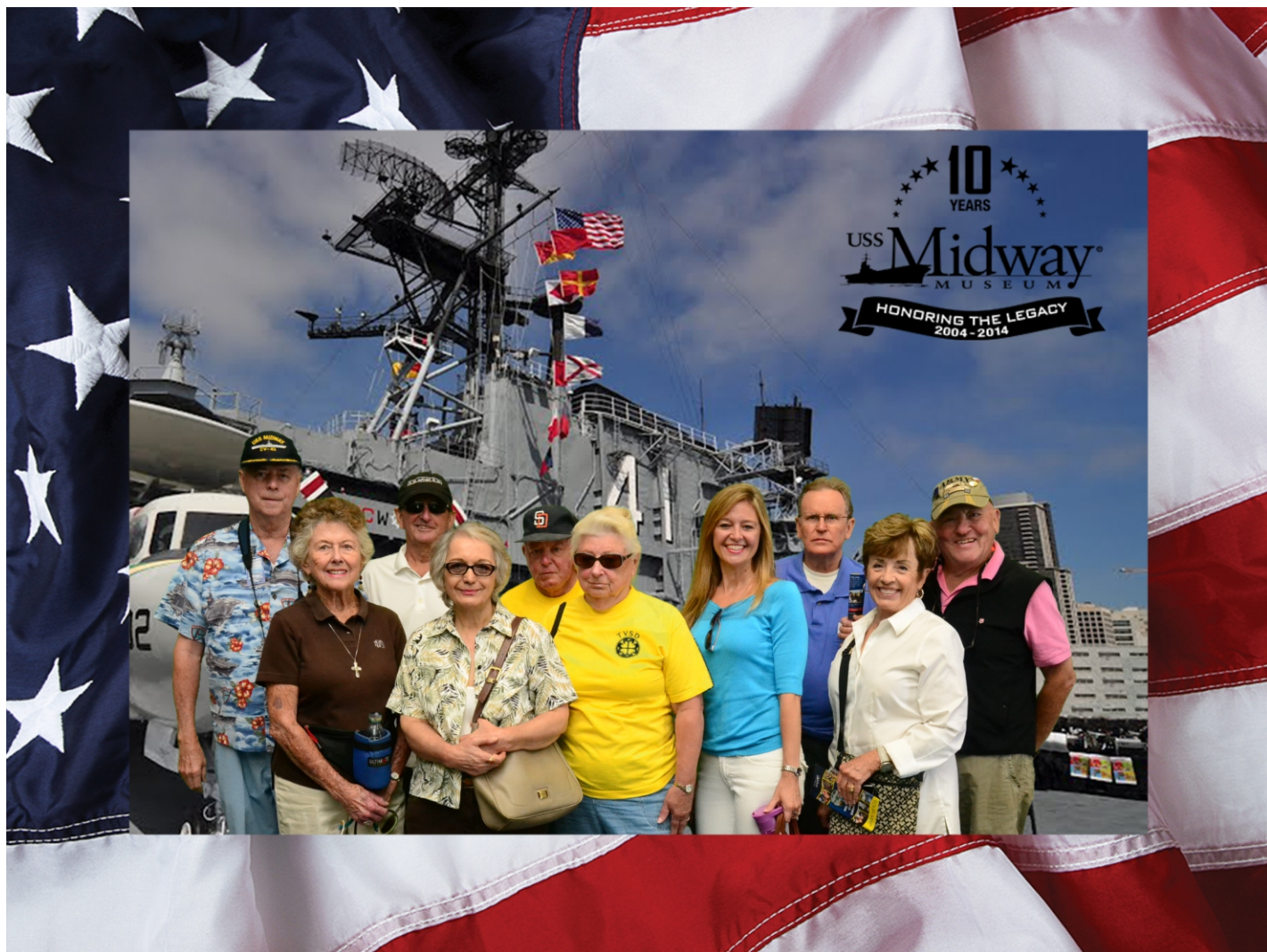
USS Midway 2014 – 10th Anniversary of the Museum Ship Former TVSD Member Tour