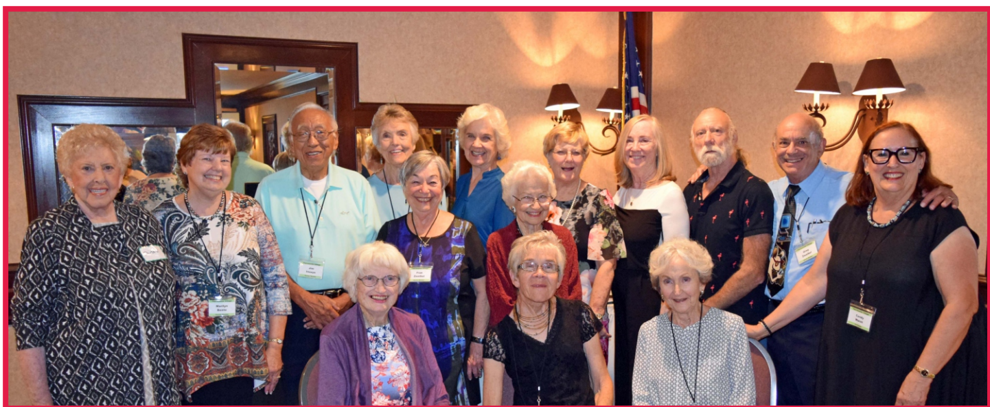
TVSD Founding Members at the Butcher Shop Banquet, September 27, 2018