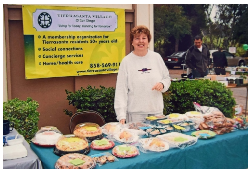
Early Bake Sale Fundraiser