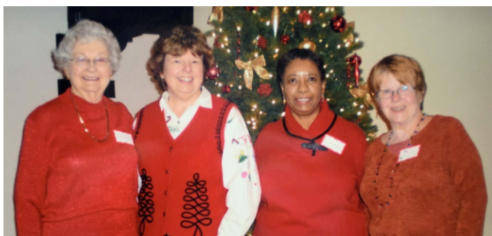
Social Historian Committee, December 2011